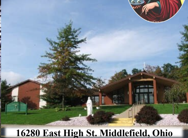
16280 East High St. Middlefield, Ohio