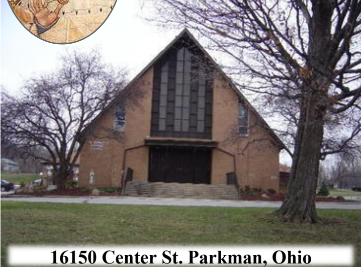
16150 Center St. Parkman, Ohio